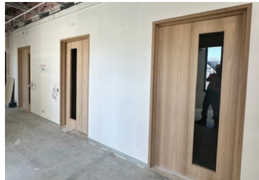
Multiplex - ECU ($1.6M)