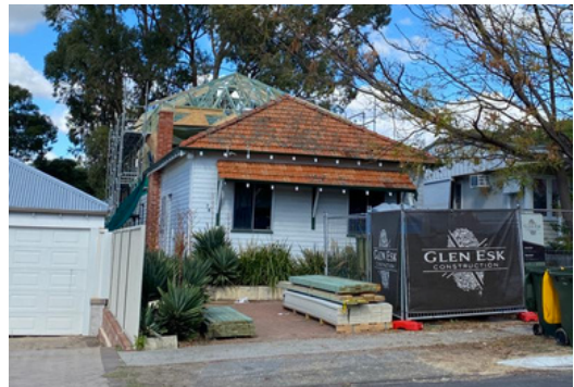
East Victoria Park ($380K)