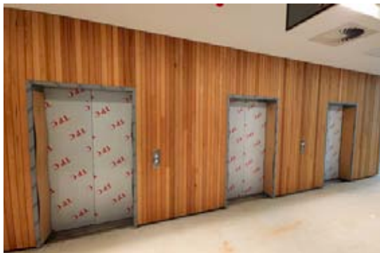
Multiplex - Murdoch Health & Knowledge Precinct ($2.5M)