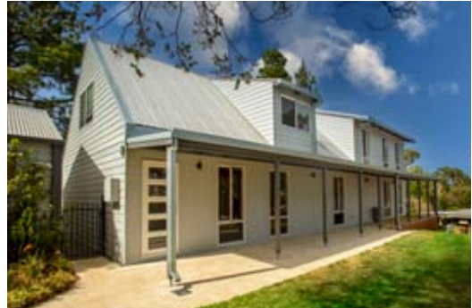
Greenmount, WA ($400K)