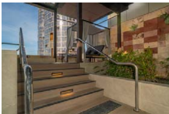
Pro Build - Ritz Carlton ($100K)