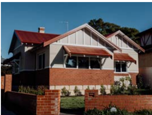
Nedlands, WA ($400K)