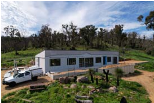
Gidgeganup, WA ($700K)