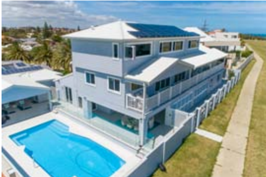
Kallaroo, WA ($800K)